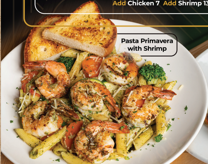
Pasta Primavera with Shrimp

ADDITIONAL PROTEINS MAY BE ADDED Add Chicken 7 Add Shrimp 13 Add Salmon 14 Add Steak* 16