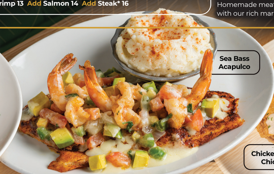
Sea Bass Acapulco