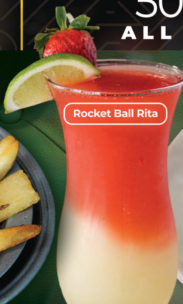
Rocket Ball Rita