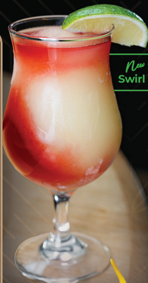
New Sangria Swirl Margarita

Choose 4 amazing flavors – Strawberry, Mango, Peach, Passion Fruit or Lime 18.