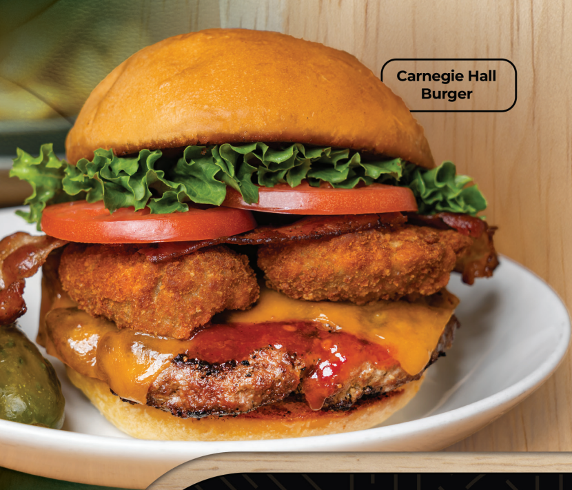
Carnegie Hall Burger