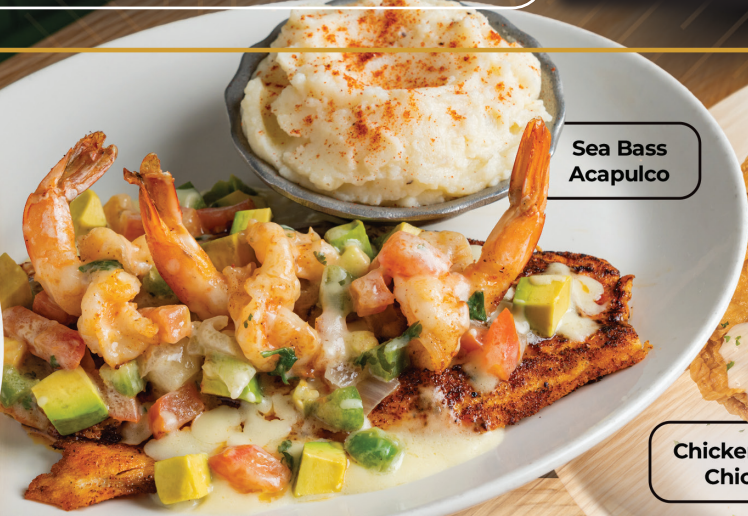
Sea Bass Acapulco