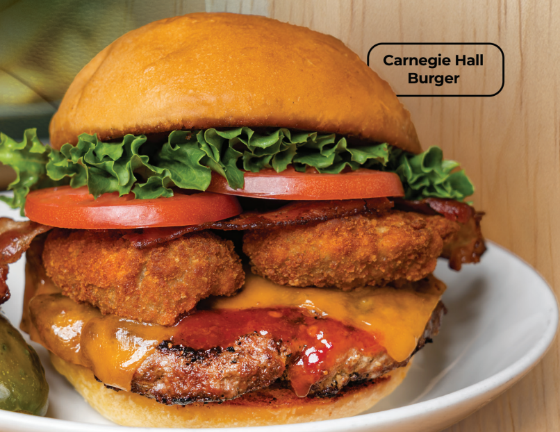
Carnegie Hall Burger