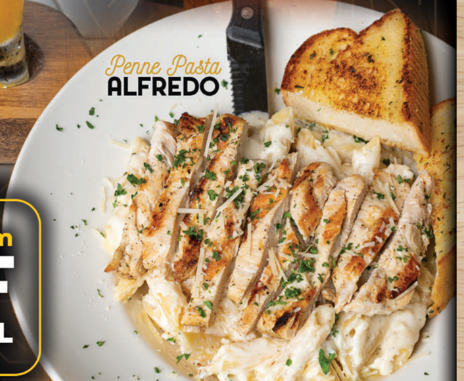
Penne Pasta ALFREDO

Happy HOUR Monday-Friday 3pm-6pm 50% OFF ALL ALCOHOL