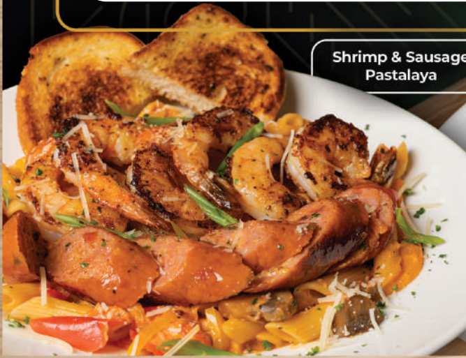
Shrimp & Sausage Pastalaya

SPAGHETTI & MEATBALLS Homemade meatballs on top of fresh imported spaghetti with our rich marinara sauce and Parmesan cheese. 15.99