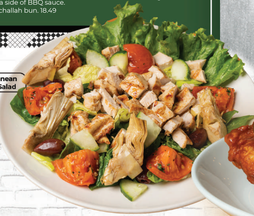
Mediterranean Chicken Salad

Grilled chicken breast with cucumber, roasted tomatoes, artichoke hearts, and Greek olives on a bed of romaine and baby spinach. 16.99