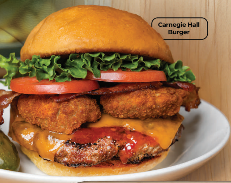
Carnegie Hall Burger