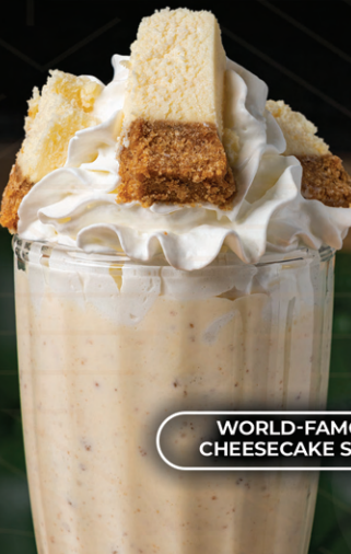
WORLD-FAMOUS CHEESECAKE SHAKE