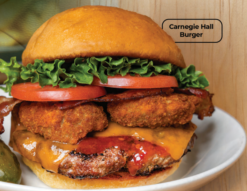
Carnegie Hall Burger