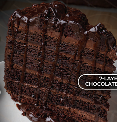
7-LAYER CHOCOLATE CAKE