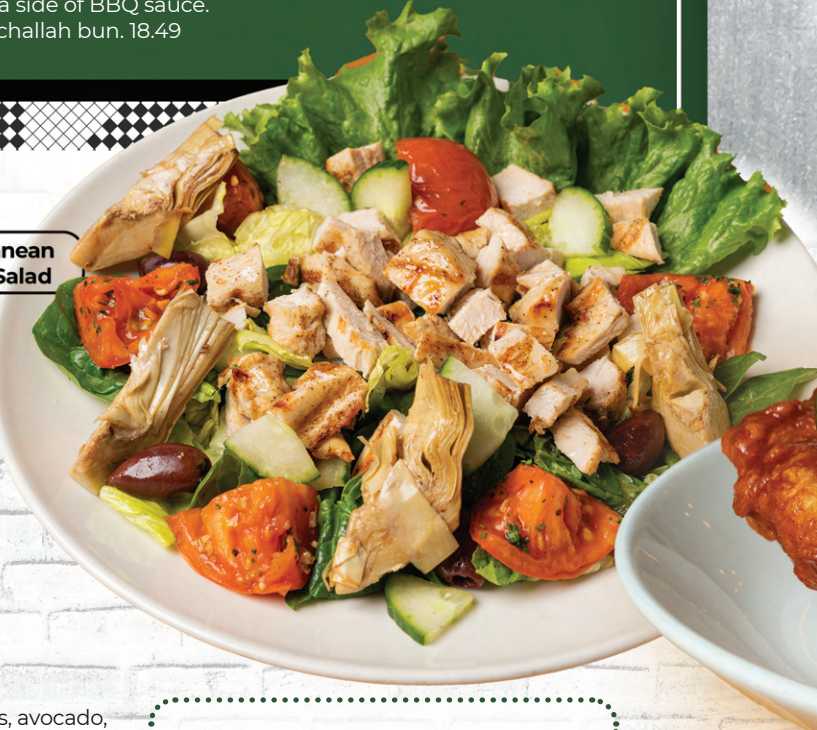
Mediterranean Chicken Salad

Grilled chicken breast with cucumber, roasted tomatoes, artichoke hearts, and Greek olives on a bed of romaine and baby spinach. 16.99