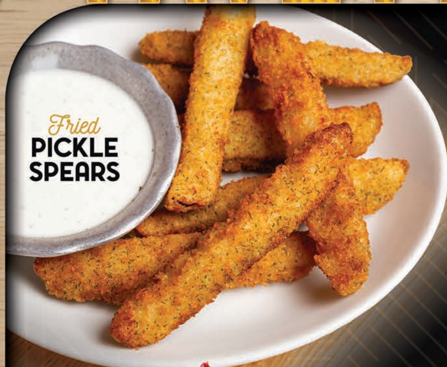
Fried PICKLE SPEARS