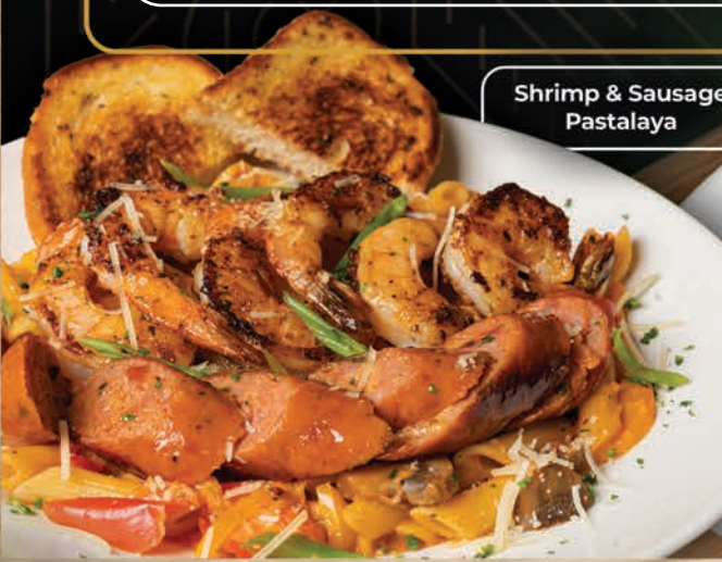
Shrimp & Sausage Pastalaya

SPAGHETTI & MEATBALLS Homemade meatballs on top of fresh imported spaghetti with our rich marinara sauce and Parmesan cheese. 15.99