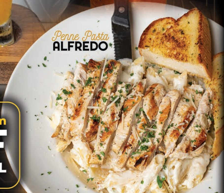
Penne Pasta ALFREDO

Happy HOUR Monday-Friday 3pm-6pm 50% OFF ALL ALCOHOL