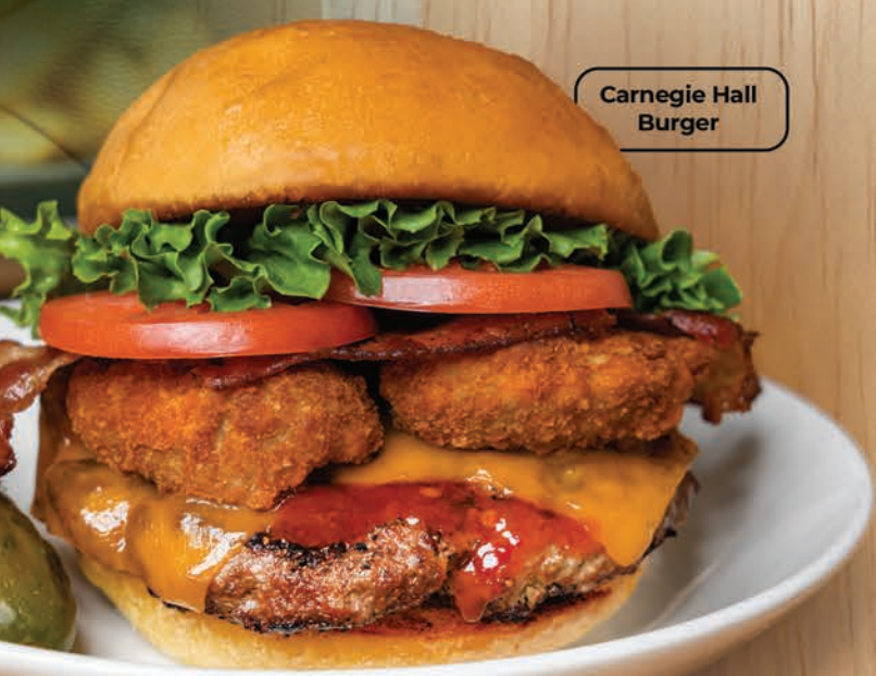
Carnegie Hall Burger