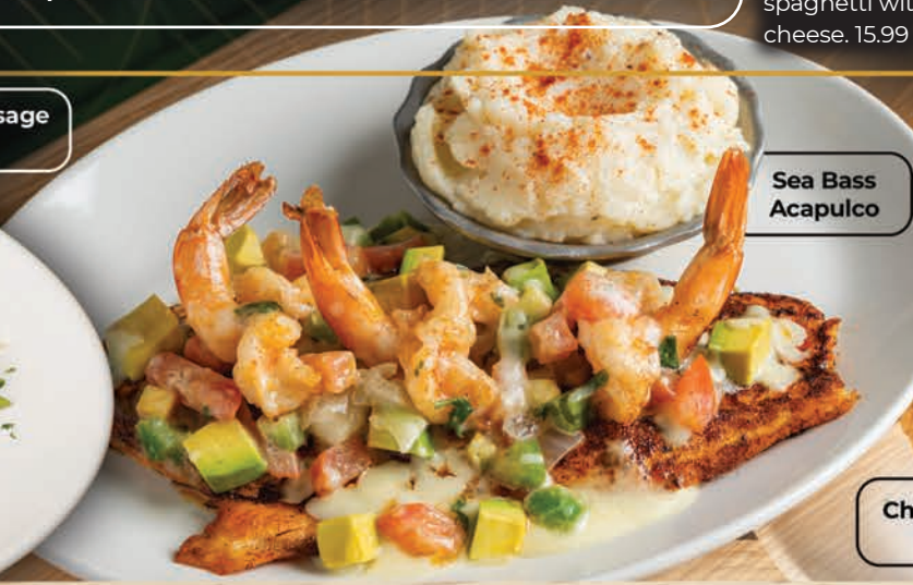
Sea Bass Acapulco