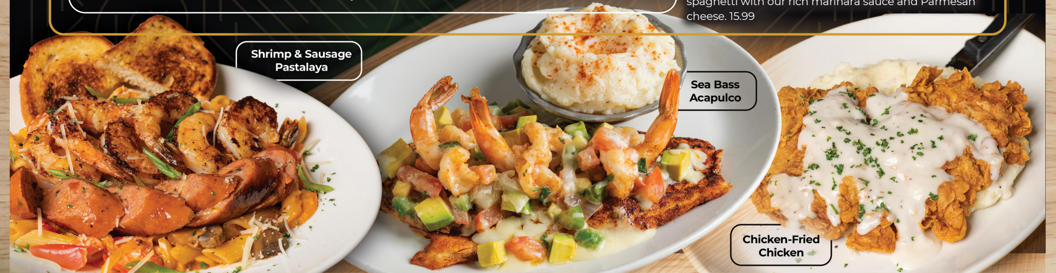
Shrimp & Sausage Pastalaya

ADDITIONAL PROTEINS MAY BE ADDED Add Chicken 7 Add Shrimp 13 Add Salmon 14 Add Steak* 16