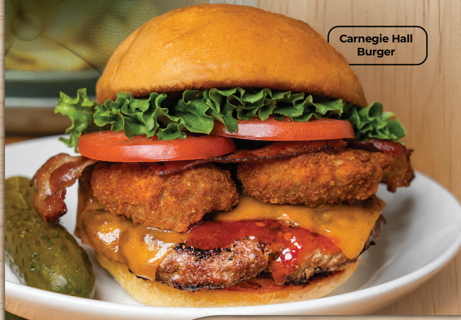
Carnegie Hall Burger

Any half signature or traditional sandwich. Not available on Thanksgiving, Christmas, or New Year's Day.