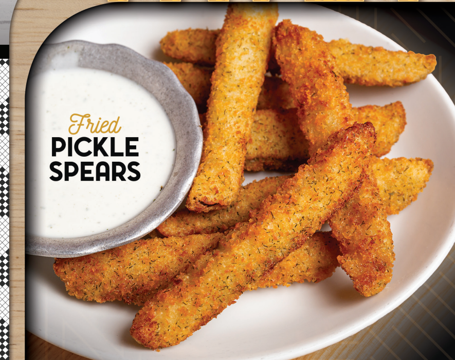
Fried PICKLE SPEARS