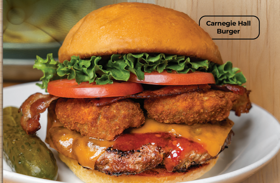
Carnegie Hall Burger

Any half signature or traditional sandwich. Not available on Thanksgiving, Christmas, or New Year's Day.