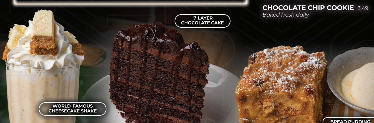
WORLD-FAMOUS CHEESECAKE SHAKE