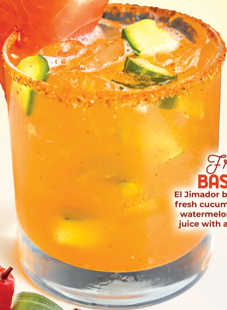
Fruit BASKET El Jimador blanco tequila, fresh cucumbers, mango, watermelon, pineapple juice with a Tajin rim. 12