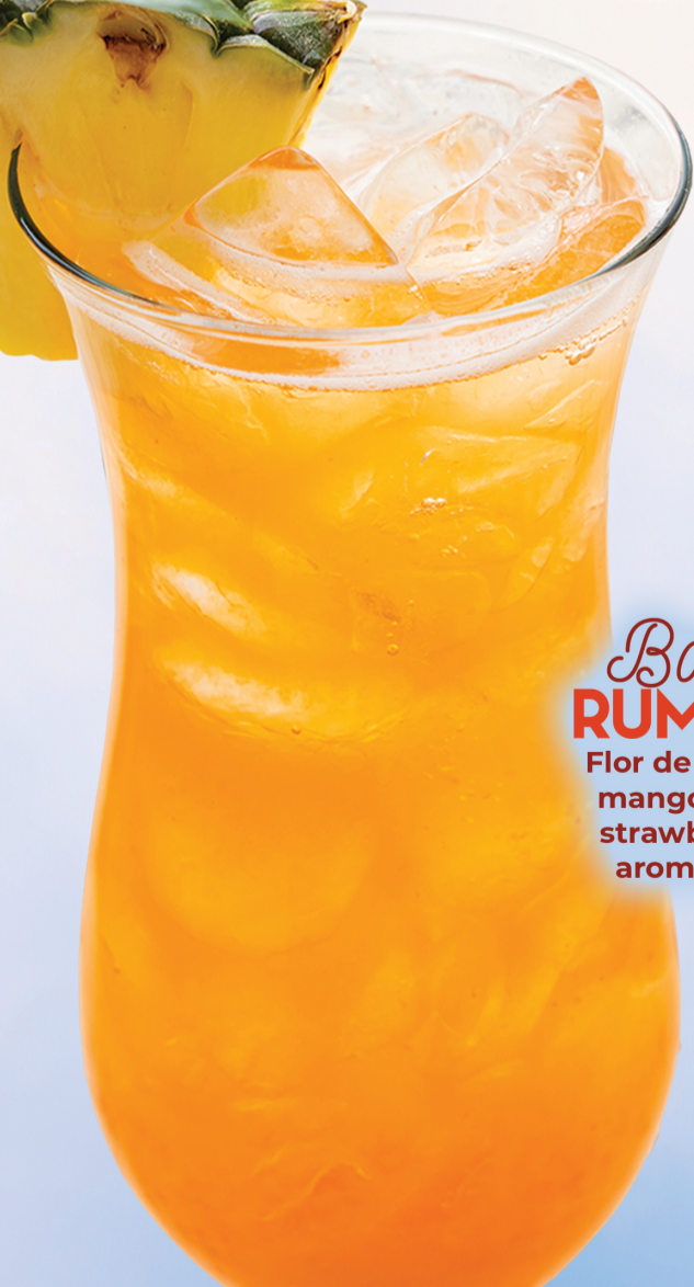
Barbados RUM PUNCH Flor de Caña dark rum, mango, passion fruit, strawberry and Hella aromatic bitters. 12