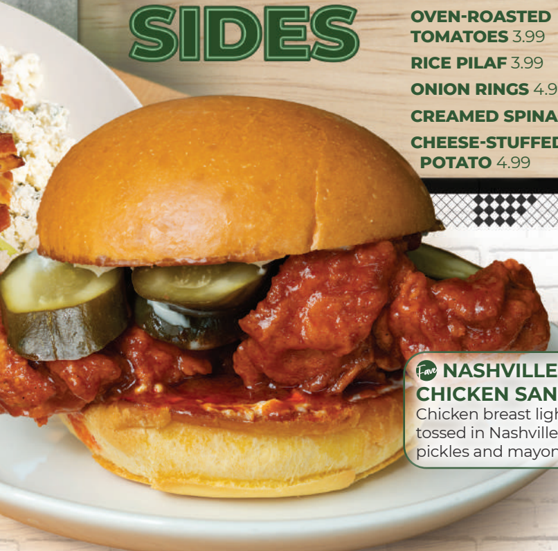
NASHVILLE HOT CHICKEN SANDWICH Chicken breast lightly fried and tossed in Nashville hot sauce, with pickles and mayonnaise. 17.99