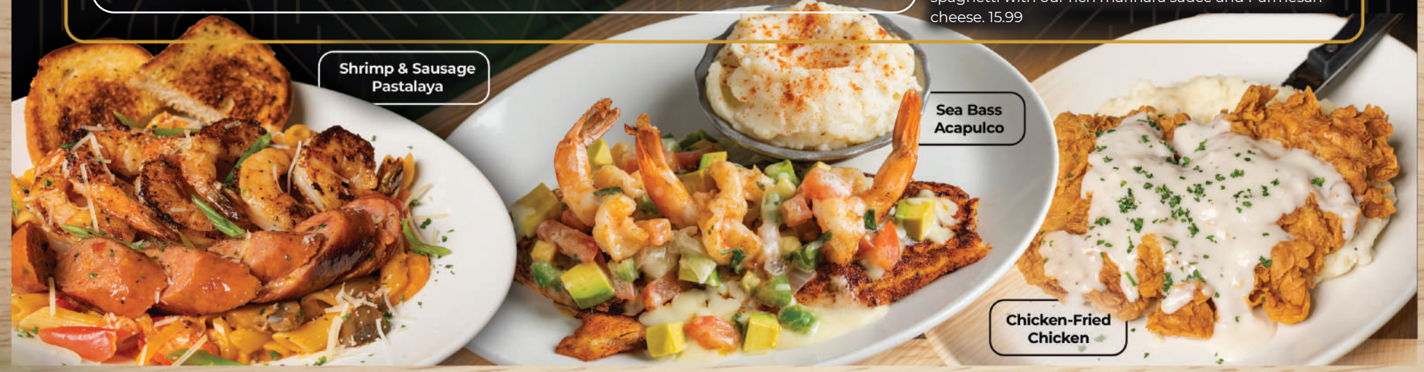
Shrimp & Sausage Pastalaya