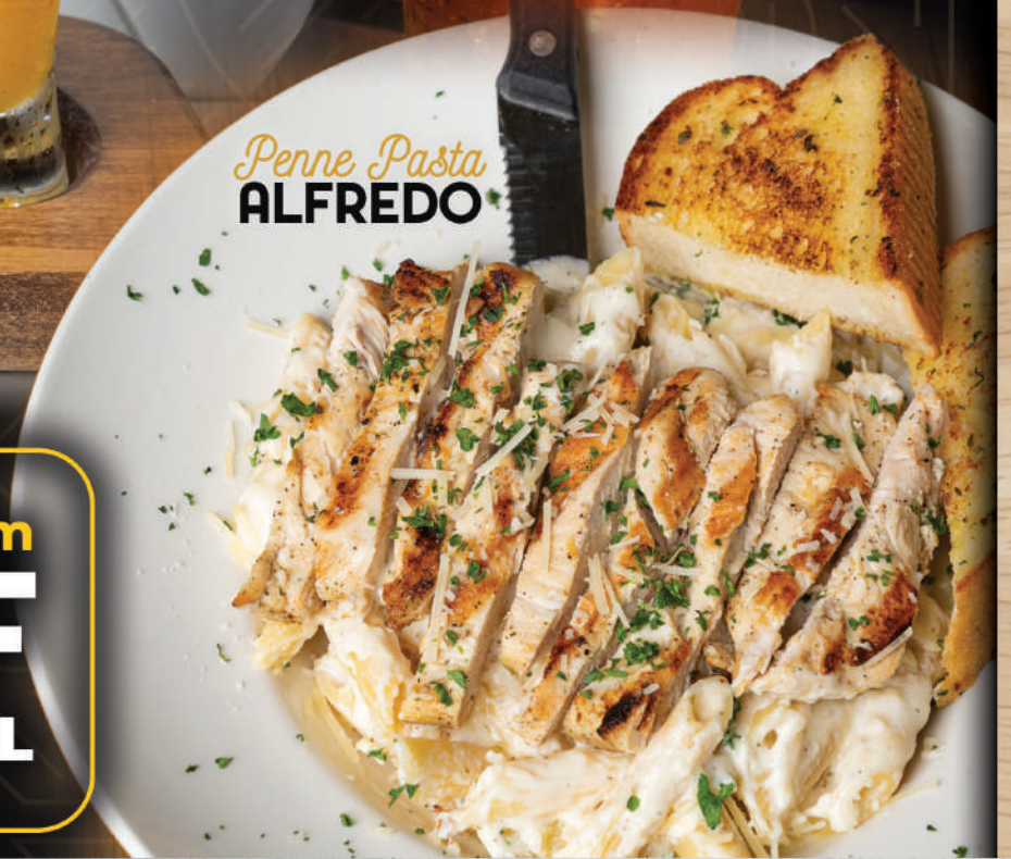
Penne Pasta ALFREDO

Happy HOUR Monday-Friday 3pm-6pm 50% OFF ALL ALCOHOL