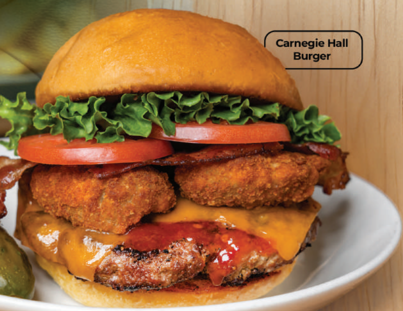
Carnegie Hall Burger