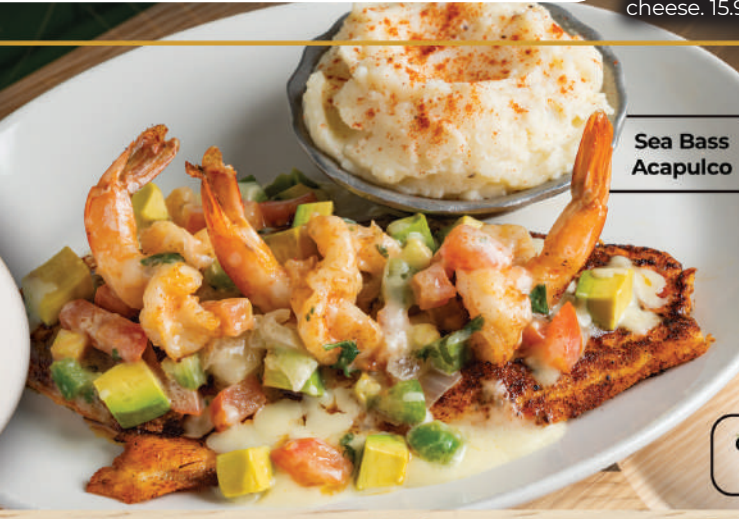
Sea Bass Acapulco