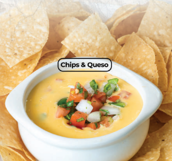
Chips & Queso

Tossed in Buffalo, BBQ, Nashville hot, gochujang or raspberry chipotle. Served with celery and your choice of blue cheese or ranch. 14.99