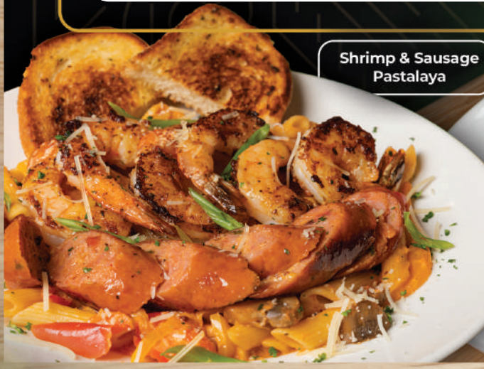
Shrimp & Sausage Pastalaya