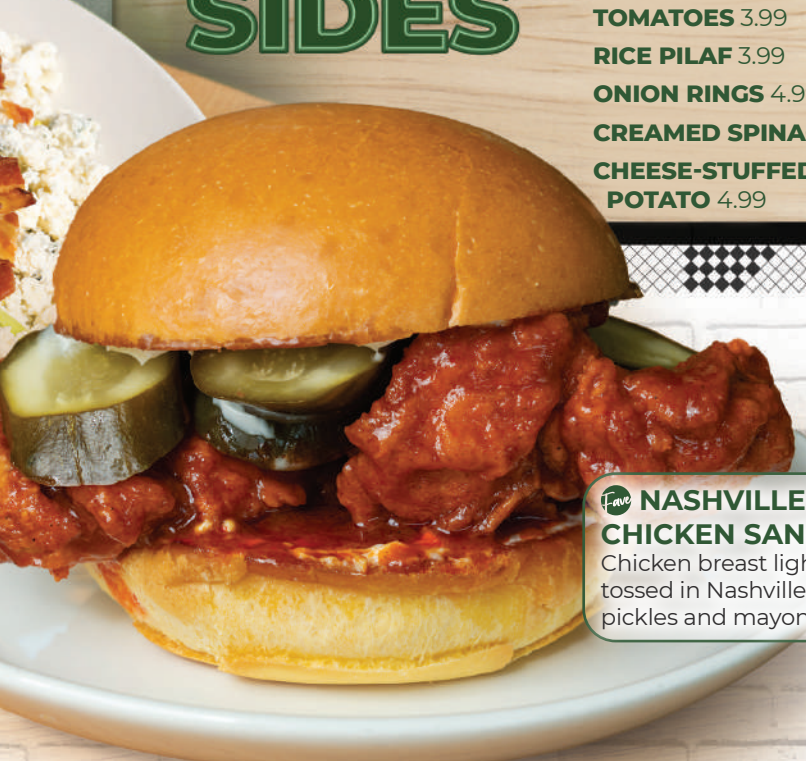
NASHVILLE HOT CHICKEN SANDWICH Chicken breast lightly fried and tossed in Nashville hot sauce, with pickles and mayonnaise. 17.99