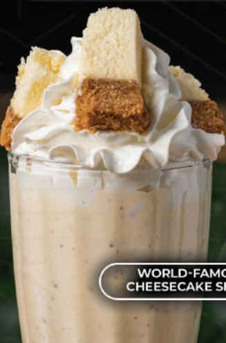
WORLD-FAMOUS CHEESECAKE SHAKE