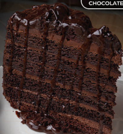
7-LAYER CHOCOLATE CAKE