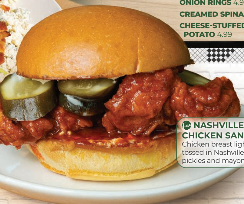
NASHVILLE HOT CHICKEN SANDWICH Chicken breast lightly fried and tossed in Nashville hot sauce, with pickles and mayonnaise. 17.99