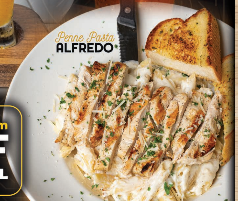
Penne Pasta ALFREDO

Happy HOUR Monday-Friday 3pm-6pm 50% OFF ALL ALCOHOL