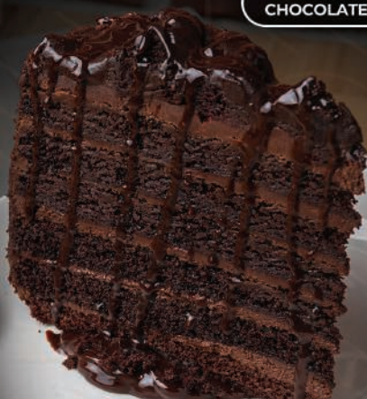
7-LAYER CHOCOLATE CAKE