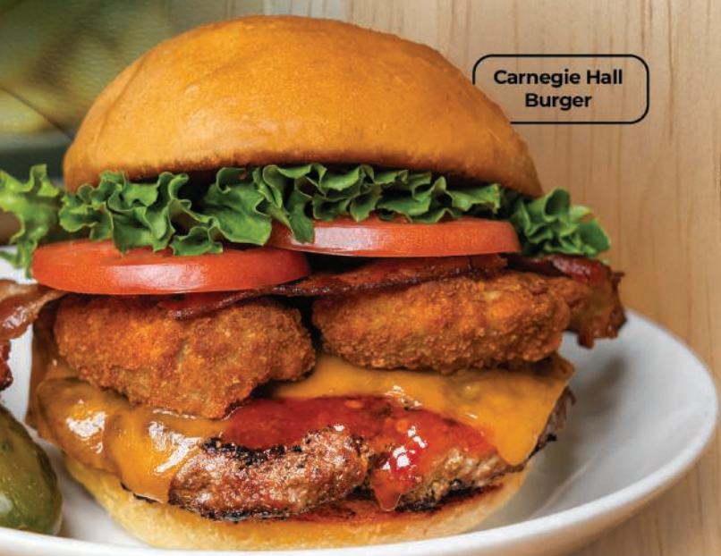
Carnegie Hall Burger