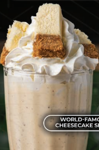
WORLD-FAMOUS CHEESECAKE SHAKE